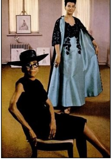
Signature hand-made floral elements