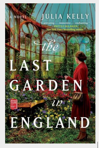
The Last Garden in England by Julia Kelly

From the author of the international bestsellers The Light Over London and The Whispers of War comes "a compelling read, filled with lovable characters and an alluring twist of fates" (Ellen Keith, author of The Dutch Wife) about five women living across three different times whose lives are all connected by one very special garden.